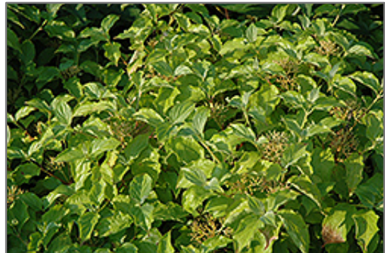
Arctic Sun Dogwood foliage