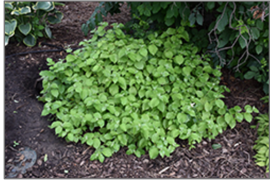
Arctic Sun Dogwood