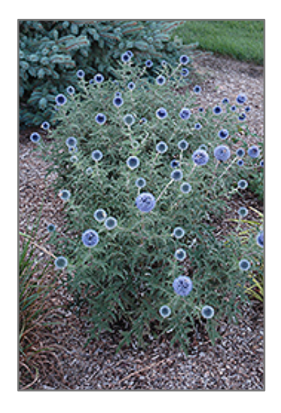
Blue Glow Globe Thistle in bloom

CustomerCare@WestonNurseries.com 93 East Main Street Hopkinton MA 02148 - (508) 435-3414 160 Pine Hill Road Chelmsford MA 01824 - (978) 349-0055 COMMERCIAL: commsales@westonnurseries.com - (508) 293-8028