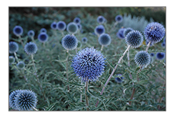
Blue Glow Globe Thistle flowers

Blue Glow Globe Thistle is recommended for the following landscape applications;