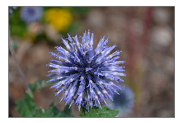
Blue Glow Globe Thistle flowers

Blue Glow Globe Thistle will grow to be about 3 feet tall at maturity extending to 4 feet tall with the flowers, with a spread of 24 inches. The flower stalks can be weak and so it may require staking in exposed sites or excessively rich soils. It grows at a fast rate, and under ideal conditions can be expected to live for approximately 10 years. As an herbaceous perennial, this plant will usually die back to the crown each winter, and will regrow from the base each spring. Be careful not to disturb the crown in late winter when it may not be readily seen!