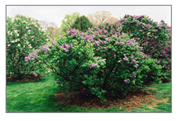
Asessippi Lilac in bloom