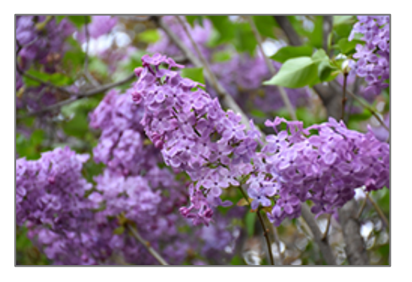
Asessippi Lilac flowers

CustomerCare@WestonNurseries.com 93 East Main Street Hopkinton MA 02148 - (508) 435-3414 160 Pine Hill Road Chelmsford MA 01824 - (978) 349-0055 COMMERCIAL: commsales@westonnurseries.com - (508) 293-8028