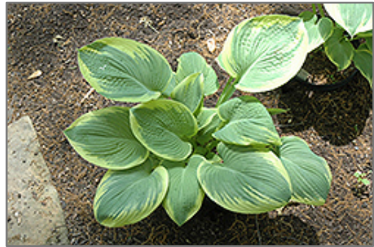
Robert Frost Hosta