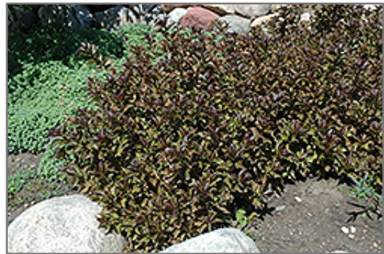
Dark Horse Weigela