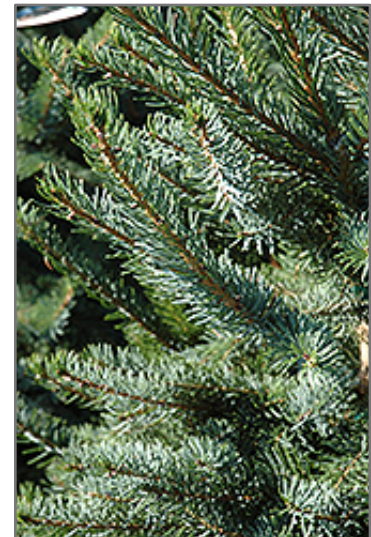
Bruns Spruce foliage