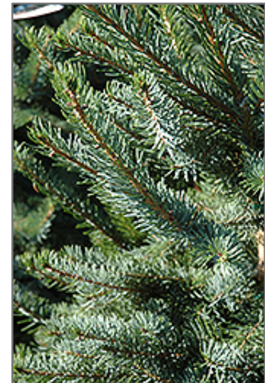
Bruns Spruce foliage