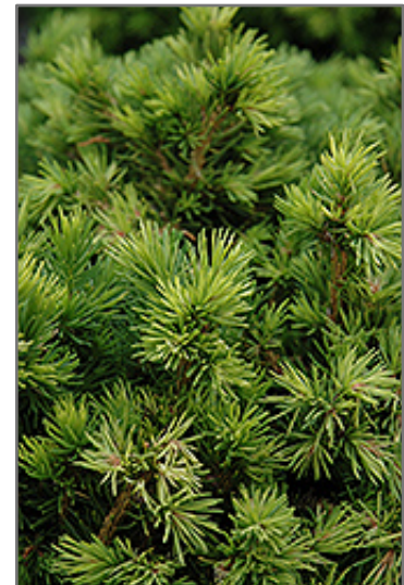
Tompa Dwarf Spruce foliage