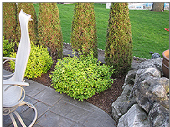
Country Gold Wintercreeper