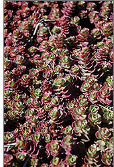
Red Carpet Stonecrop foliage

This plant will require occasional maintenance and upkeep, and is best cleaned up in early spring before it resumes active growth for the season. Deer don't particularly care for this plant and will usually leave it alone in favor of tastier treats. Gardeners should be aware of the following characteristic(s) that may warrant special consideration;