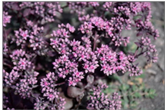
Red Carpet Stonecrop flowers