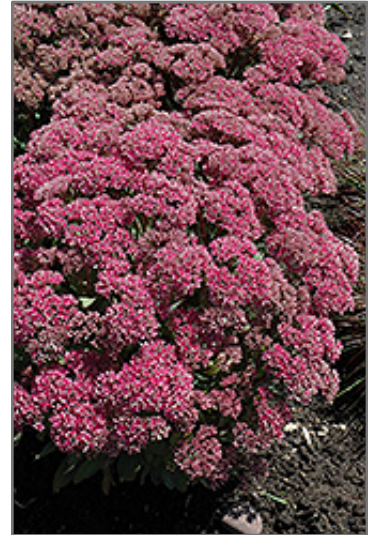
Mr. Goodbud Stonecrop flowers

Mr. Goodbud Stonecrop is recommended for the following landscape applications;