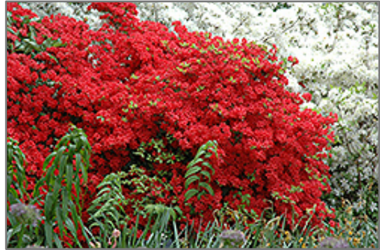
Stewartstonian Azalea in bloom