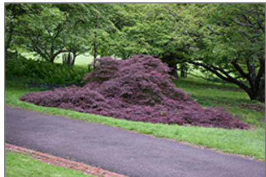
Garnet Cutleaf Japanese Maple