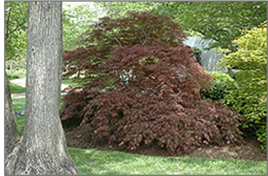
Garnet Cutleaf Japanese Maple

Garnet Cutleaf Japanese Maple will grow to be about 10 feet tall at maturity, with a spread of 8 feet. It has a low canopy with a typical clearance of 1 foot from the ground, and is suitable for planting under power lines. It grows at a fast rate, and under ideal conditions can be expected to live for 60 years or more.