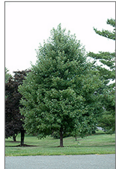
October Glory Red Maple