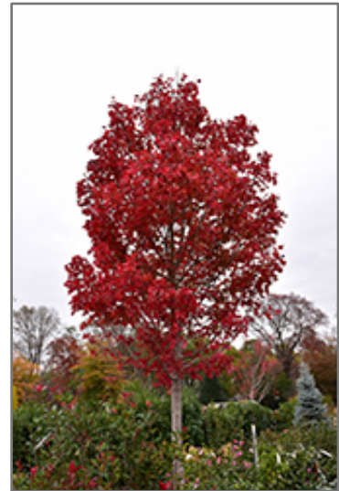
October Glory Red Maple in fall