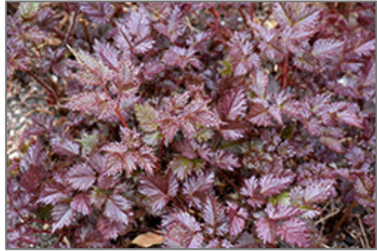
Delft Lace Astilbe foliage

Delft Lace Astilbe is a fine choice for the garden, but it is also a good selection for planting in outdoor pots and containers. With its upright habit of growth, it is best suited for use as a 'thriller' in the 'spiller-thriller-filler' container combination; plant it near the center of the pot, surrounded by smaller plants and those that spill over the edges. Note that when growing plants in outdoor containers and baskets, they may require more frequent waterings than they would in the yard or garden.