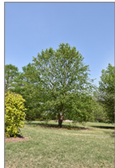
Dura Heat River Birch