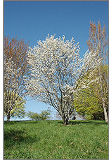
Princess Diana Serviceberry in bloom