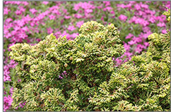
Verdon Dwarf Hinoki Falsecypress foliage