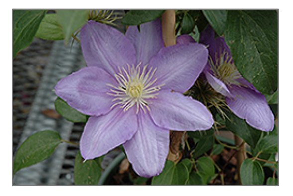
Cezanne Clematis flowers

93 East Main Street Hopkinton MA 02148 - (508) 435-3414 160 Pine Hill Road Chelmsford MA 01824 - (978) 349-0055 COMMERCIAL: commsales@westonnurseries.com - (508) 293-8028