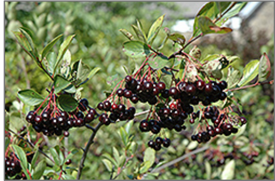
Autumn Magic Black Chokeberry fruit

This shrub should only be grown in full sunlight. It is an amazingly adaptable plant, tolerating both dry conditions and even some standing water. It is not particular as to soil type or pH, and is able to handle environmental salt. It is somewhat tolerant of urban pollution. This is a selection of a native North American species.