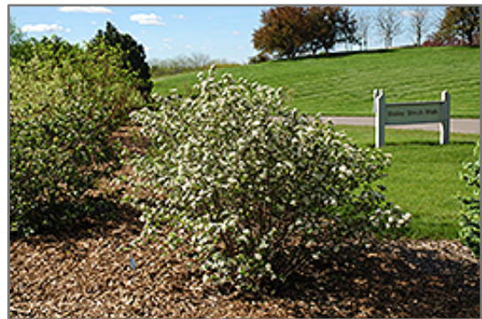
Autumn Magic Black Chokeberry in bloom