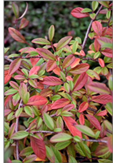
Scarlet Leader Willowleaf Cotoneaster in fall

This shrub does best in full sun to partial shade. It is very adaptable to both dry and moist growing conditions, but will not tolerate any standing water. It is not particular as to soil type or pH, and is able to handle environmental salt. It is highly tolerant of urban pollution and will even thrive in inner city environments. This is a selected variety of a species not originally from North America.