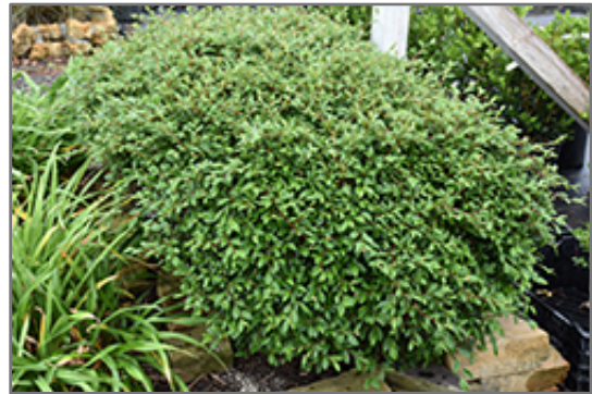
Scarlet Leader Willowleaf Cotoneaster

This shrub will require occasional maintenance and upkeep, and should not require much pruning, except when necessary, such as to remove dieback. It is a good choice for attracting birds to your yard, but is not particularly attractive to deer who tend to leave it alone in favor of tastier treats. Gardeners should be aware of the following characteristic(s) that may warrant special consideration;