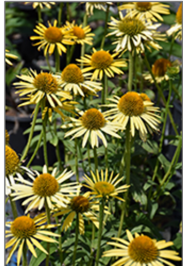
Maui Sunshine Coneflower flowers