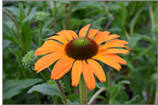
Tangerine Dream Coneflower flowers

Tangerine Dream Coneflower is recommended for the following landscape applications;