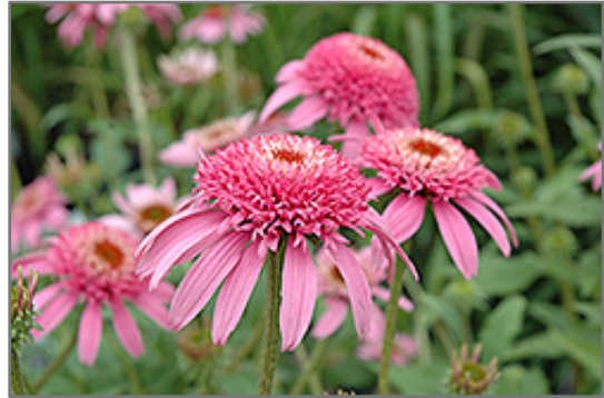
Cone-fections Pink Double Delight Coneflower flowers

Cone-fections Pink Double Delight Coneflower is recommended for the following landscape applications;