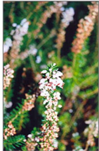
Scotch Heather flowers