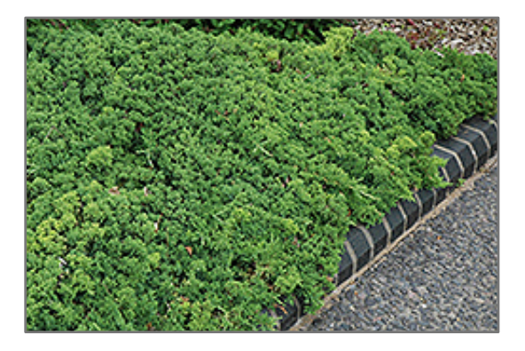
Green Mound Dwarf Japanese Juniper

This is a relatively low maintenance shrub, and is best pruned in late winter once the threat of extreme cold has passed. Deer don't particularly care for this plant and will usually leave it alone in favor of tastier treats. It has no significant negative characteristics.