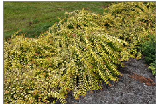
Dream Catcher Beautybush