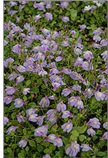
Creeping Mazus flowers

Creeping Mazus is recommended for the following landscape applications;