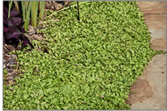
Creeping Mazus

Creeping Mazus will grow to be only 2 inches tall at maturity extending to 3 inches tall with the flowers, with a spread of 12 inches. Its foliage tends to remain low and dense right to the ground. It grows at a fast rate, and under ideal conditions can be expected to live for approximately 10 years. As an evergreen perennial, this plant will typically keep its form and foliage year-round.