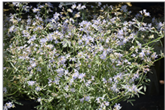
Touch Of Class Jacob's Ladder flowers