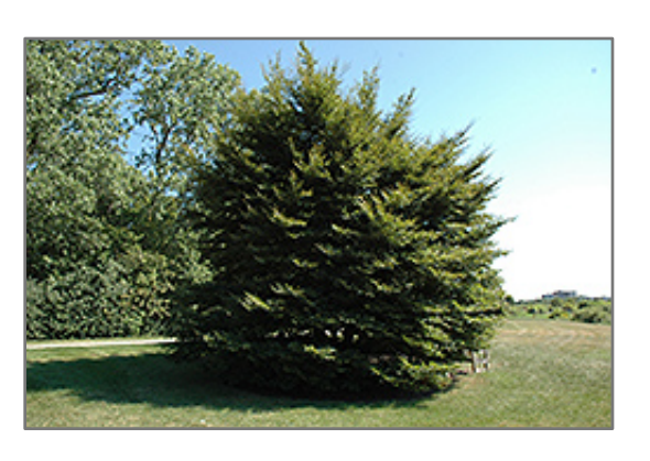
Cutleaf Beech