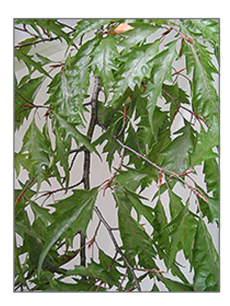
Cutleaf Beech foliage