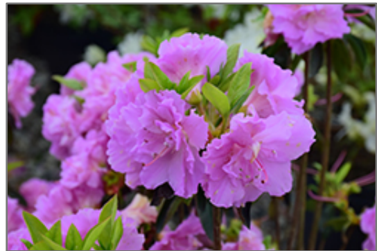
Elsie Lee Azalea flowers