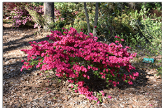
Girard's Fuchsia Evergreen Azalea in bloom