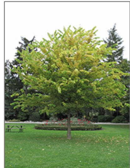
Common Hackberry in fall