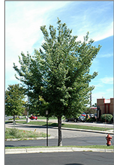
Common Hackberry