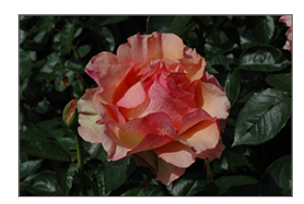
Sunstruck Rose flowers