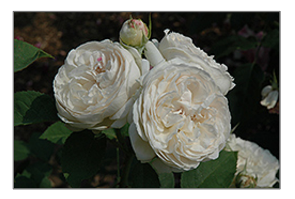
Winchester Cathedral Rose flowers

93 East Main Street Hopkinton MA 02148 - (508) 435-3414 160 Pine Hill Road Chelmsford MA 01824 - (978) 349-0055 COMMERCIAL: commsales@westonnurseries.com - (508) 293-8028