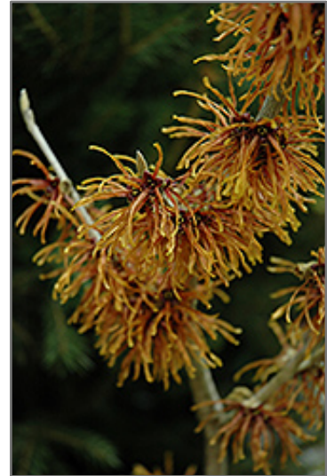
Jelena Witchhazel flowers

Jelena Witchhazel is recommended for the following landscape applications;