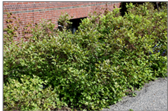
Shrub Yellowroot