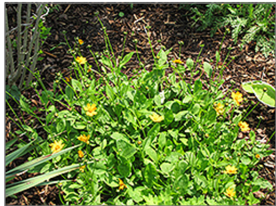
Sunshine Superman Tickseed in bloom