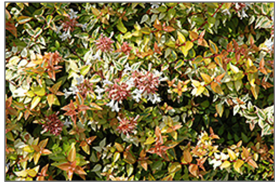
Kaleidoscope Abelia flowers

This shrub will require occasional maintenance and upkeep, and should only be pruned after flowering to avoid removing any of the current season's flowers. It is a good choice for attracting birds, bees and butterflies to your yard, but is not particularly attractive to deer who tend to leave it alone in favor of tastier treats. It has no significant negative characteristics.