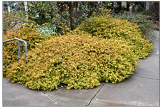
Kaleidoscope Abelia

Kaleidoscope Abelia will grow to be about 30 inches tall at maturity, with a spread of 4 feet. It tends to fill out right to the ground and therefore doesn't necessarily require facer plants in front. It grows at a slow rate, and under ideal conditions can be expected to live for approximately 30 years.