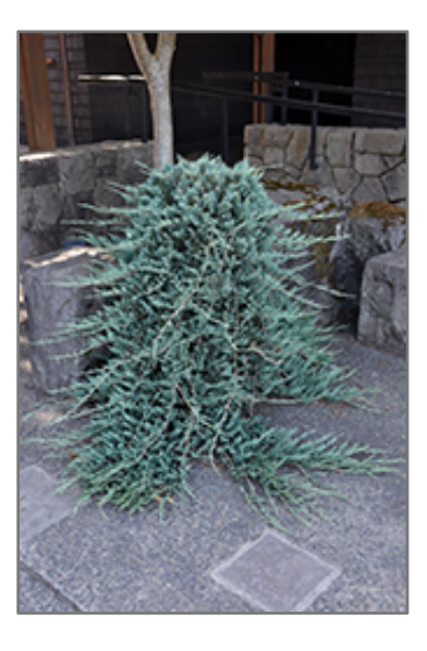
Blue Rug Juniper

Blue Rug Juniper is recommended for the following landscape applications;