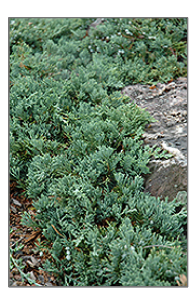
Blue Rug Juniper foliage