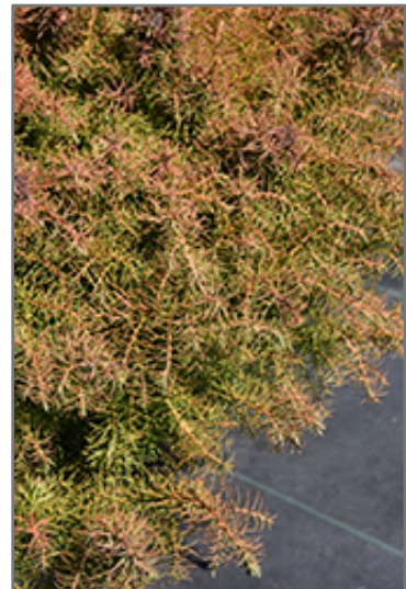
Mushroom Japanese Cedar foliage