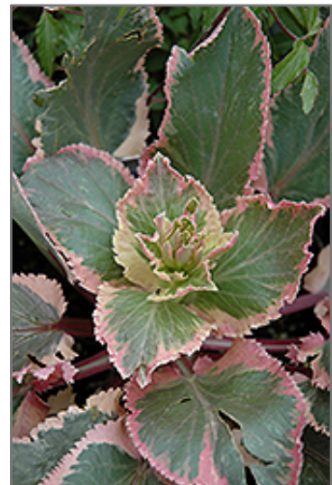
Jade Frost Variegated Sea Holly foliage