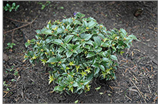
Rock Garden Holly