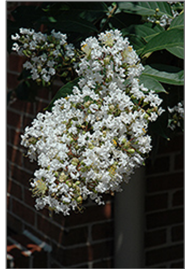
Natchez Crapemyrtle flowers

This is a relatively low maintenance tree, and is best pruned in late winter once the threat of extreme cold has passed. Deer don't particularly care for this plant and will usually leave it alone in favor of tastier treats. It has no significant negative characteristics.