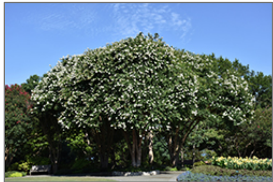
Natchez Crapemyrtle in bloom