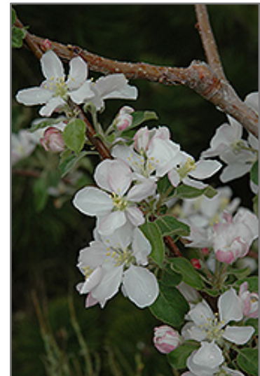
Pink Lady Apple flowers