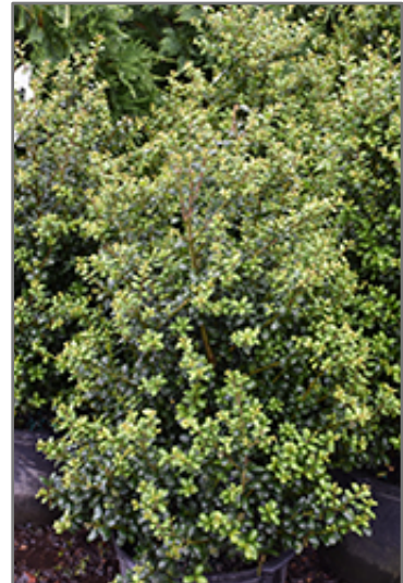
Chesapeake Japanese Holly