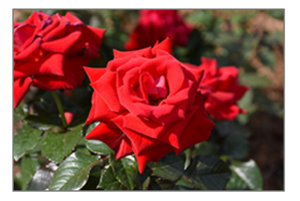
Drop Dead Red Rose flowers

93 East Main Street Hopkinton MA 02148 - (508) 435-3414 160 Pine Hill Road Chelmsford MA 01824 - (978) 349-0055 COMMERCIAL: commsales@westonnurseries.com - (508) 293-8028