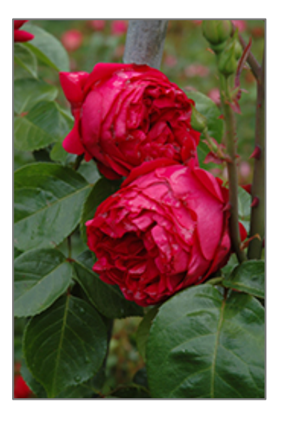
Red Eden Rose flowers