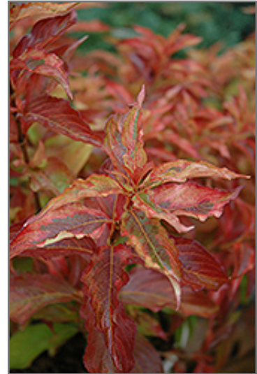
My Monet Sunset Weigela in fall

My Monet Sunset Weigela makes a fine choice for the outdoor landscape, but it is also well-suited for use in outdoor pots and containers. It is often used as a 'filler' in the 'spiller-thriller-filler' container combination, providing a mass of flowers and foliage against which the thriller plants stand out. Note that when grown in a container, it may not perform exactly as indicated on the tag - this is to be expected. Also note that when growing plants in outdoor containers and baskets, they may require more frequent waterings than they would in the yard or garden.