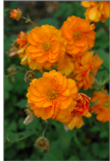
Fire Storm Avens flowers

Fire Storm Avens is recommended for the following landscape applications;