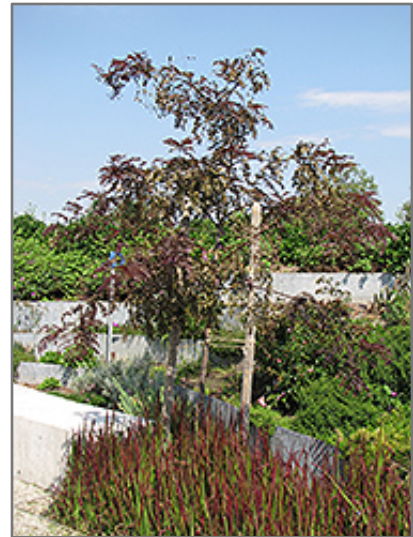
Ruby Lace Honeylocust

This tree should only be grown in full sunlight. It is very adaptable to both dry and moist locations, and should do just fine under average home landscape conditions. It is not particular as to soil type or pH, and is able to handle environmental salt. It is highly tolerant of urban pollution and will even thrive in inner city environments. This is a selection of a native North American species.