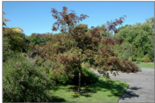
Ruby Lace Honeylocust